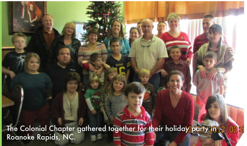
The Colonial Chapter gathered together for their holiday party 2012 02:5 Roanoke Rapids, NC.

*For exact list of counties in chapter please contact a District or Chapter Officer