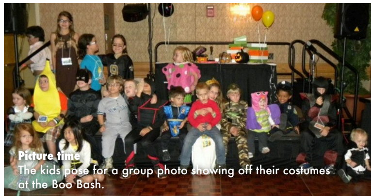
Picture time The kids pose for a group photo showing off their costumes at the Boo Bash.

For those attending the regional please take a survey that we have created: http://www.surveymonkey.com/s/SQBHPMQ