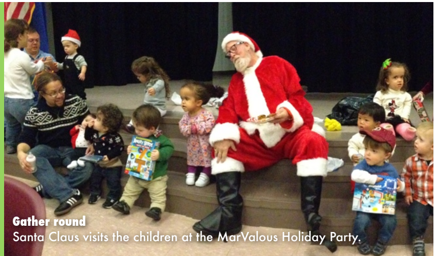
Gather round Santa Claus visits the children at the MarValous Holiday Party.

*For exact list of counties in chapter please contact a District or Chapter Officer