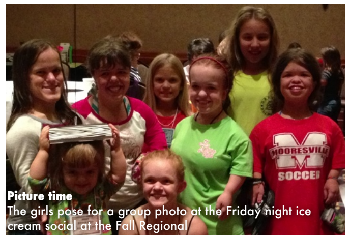
Picture time The girls pose for a group photo at the Friday night ice cream social at the Fall Regional